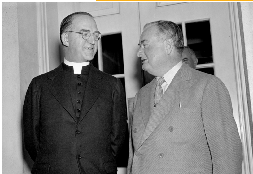
Father Edward Joseph Flanagan (left), during a visit to the White House, October 13, 1938

Remember, O most chaste spouse of the Virgin Mary, that never was it known that anyone who implored your help and sought your intercession was left unassisted. Full of confidence in your power, I fly to you, and beg your protection. Despise not, O foster-father of the Redeemer, my humble supplication, but in your bounty, hear and answer me. Amen. ■